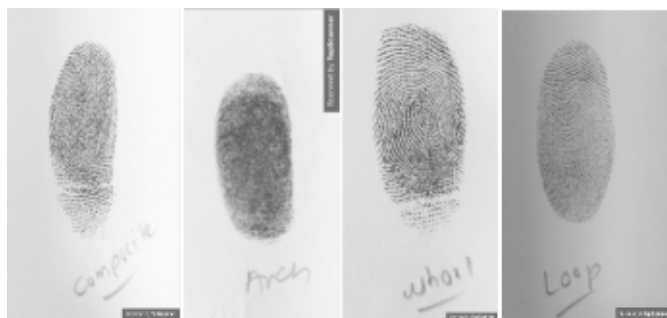
Figure 1: Shows fingerprints according to Michael and Kunken classification method

Figure 2 shows patterns of lip printing obtained from the participating individuals depending on Tsuchihashi or Suzuki lip prints classification Method. Significant patterns include Type I, I', II, III, IV, V.