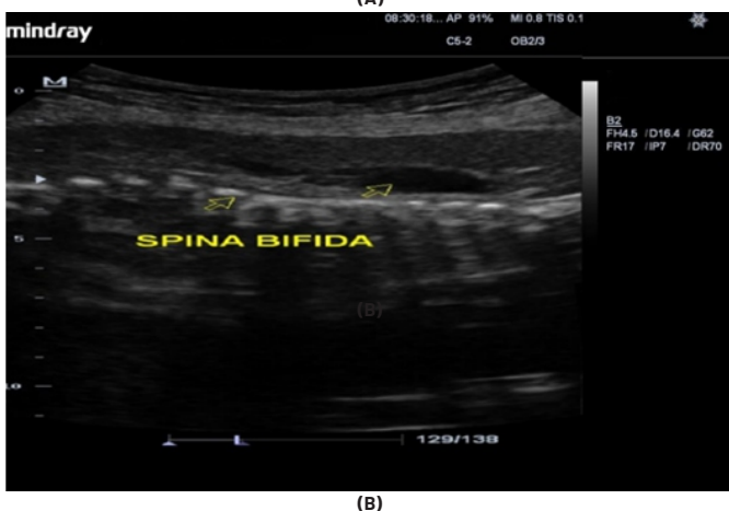
Figure 1: (A) Severe ventriculomegaly at 30 weeks of gestation, (B) Spina Bifida

Figure 2 (C) represent severe ventriculomegaly, and 2 patients were with meningocele(D).