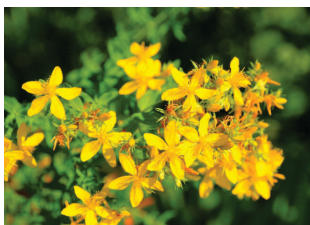
Figure 1: Hypericum perforatum (St. John's wort)

retitled as hypericin by Cerny in the 1911 [2]. In 1939, first comprehensive isolation report of the hypericin by the Hypericum perforatum was issued by the Brockmann et al., [3]. In 1942, very first chemical formula of the compound hypericin had been reported by Brockmann et al., [4] that is C 30 H 16 O 8 as well as after 8 years, accurate structure had been published by same author [5].