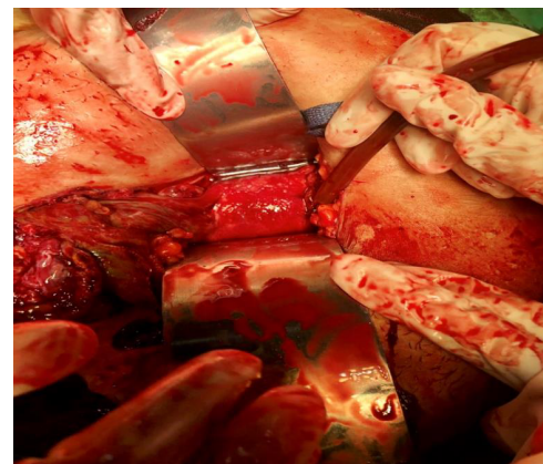
Figure 1: Image of A Densely Adherent Placenta