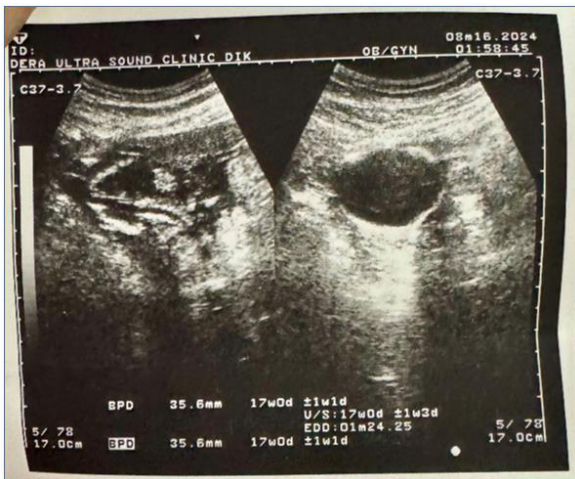
Figure 2: Extra-Uterine Fetus Lying in the Right Iliac Fossa in a View of Full Urinary Bladder

Extra-uterine fetus lying in the right iliac fossa is given a full urinary bladder, as shown in Figure 2.