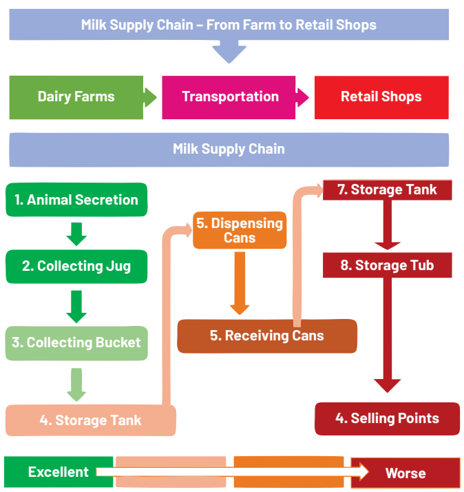
Figure 2: Flow chart of complete milk supply chain

For the detection of Listeria monocytogenes, 25 ml milk sample was transferred to 225 ml Listeria broth having 2.5 ml mixture of selective supplement and incubated it for 24 hours at 35°C. After the incubation 1 ml was transferred to BHI (brain heart infusion) agar plates and incubated for next 48 hours at 35^{\circ} C. Similarly, for the Salmonella (isolation): 25 ml milk sample was mixed in 225 ml lactose broth and incubated for 24 hours at 35°C. 0.1 ml of the incubated sample was transferred to 10 ml RV (Rappaport Vassiliadis) medium and another 1 ml to 10 ml TT (Tetrathionate) broth. RV medium was incubated for 24 hours at 42°C and TT broth tubes for 24 hours at 43°C. A loopful (10 µl) of incubated TT broth was streaked on the BS (Bismuth Sulfite) agar, XLD (Xylose Lysine Deoxycholate) agar and HE (Hektoen enteric) agar plates and incubated for 24 hours at 35°C. Similar, procedure was repeated for incubated RV medium. After incubation the plates were examined.