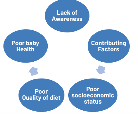
Figure 1: The matic analysis of the data

also reported by the mothers. The mother responded that recurrent illness and diarrheal diseases are most frequent among the children. They also responded that the children are not responding to the treatment and they also experience problems in approaching health care centers. The mothers were reported that their children used to eat junk food like chips, burgers and biscuits etc. the mothers also reported nutrition which is not recommended in children less than 2 years such as cow mild, black and green tea. Similarly, the mothers also reported that they rarely cook meat and provide balanced diet to the children.