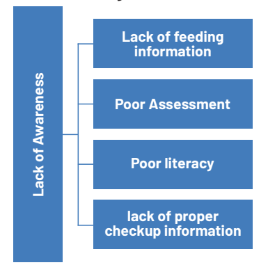
Figure 2: Catagories for the theme Lack of Awareness

The first extracted theme was "Lack of Awareness". The theme was extracted from four categories i.e. "Lack of feeding information", "Poor Assessment", "Poor Literacy", "Lack of proper checkup information" (Figure 2). Lack of awareness among the mothers regarding malnutrition was the main concern. poor assessment of the children about malnutrition was reported by the mothers. poor lateracy was also a concern which affect the awareness among the mothers reported that they were not aware about the regalar checkup of their babies for malnurishment. Also, mothers were unaware about feeding of the children.