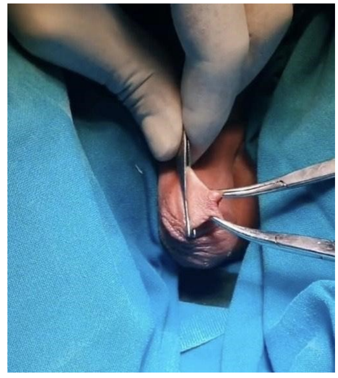
Figure 1: Foreskin is pulled and artery clamps are applied