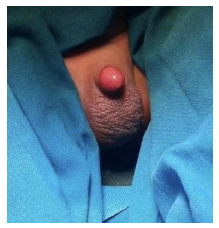
Figure 3: Final results, no incidence of trauma or bleeding