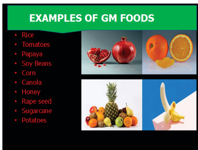
Figure 1: Genetically modified foods. Adapted from: https://pin.it/qGBvoSe